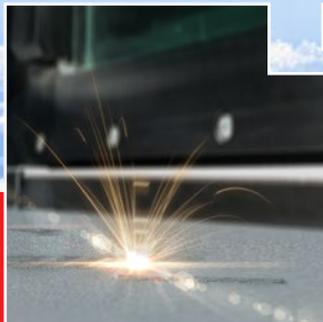
MATERIALS & STRUCTURES